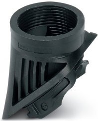
Plastic thread adapter with bayonet lock, for EVO housing series B, NPT 1/1" thread

Please be informed that the data shown in this PDF Document is generated from our Online Catalog. Please find the complete data in the user's documentation. Our General Terms of Use for Downloads are valid ( http://phoenixcontact.com/download )